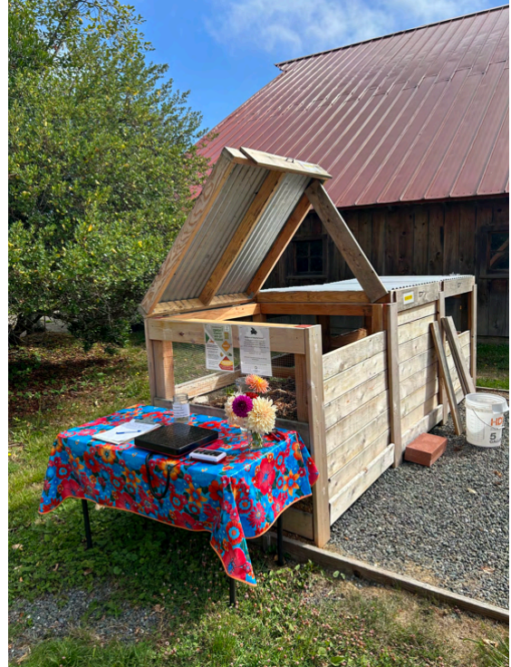
Frog friend in the Marigolds & Flying Pig Farm's compost system