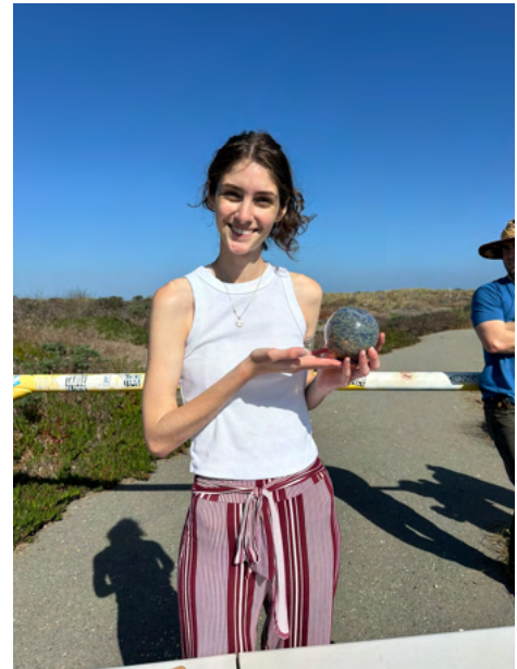
Volunteers hunting for treasure while cleaning up trash in the Samoa Dunes!