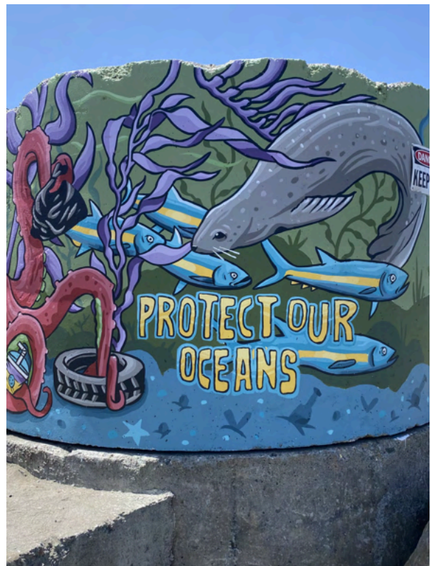
Tony Diaz | HBMWD Overflow pipe New Navy Base Road