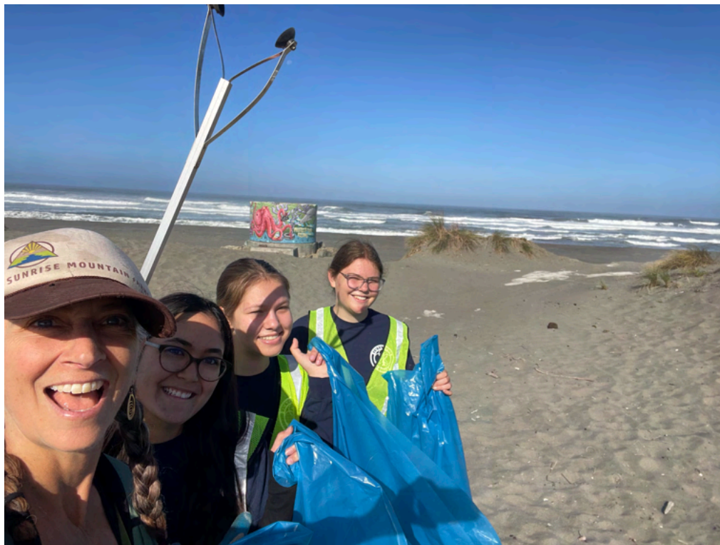
California Coastal Cleanup Day 2024

The Peninsula Beautification Project is wrapping up its final activities and will conclude at the end of the year. This initiative, funded by the Clean California Local Grants Program through Caltrans, aims to enhance the Samoa Peninsula by reducing litter, beautifying public spaces, and increasing the number of areas the public can safely enjoy. The Redwood Community Action Agency is partnering with the Humboldt Bay Harbor Recreation and Conservation District to implement the project.