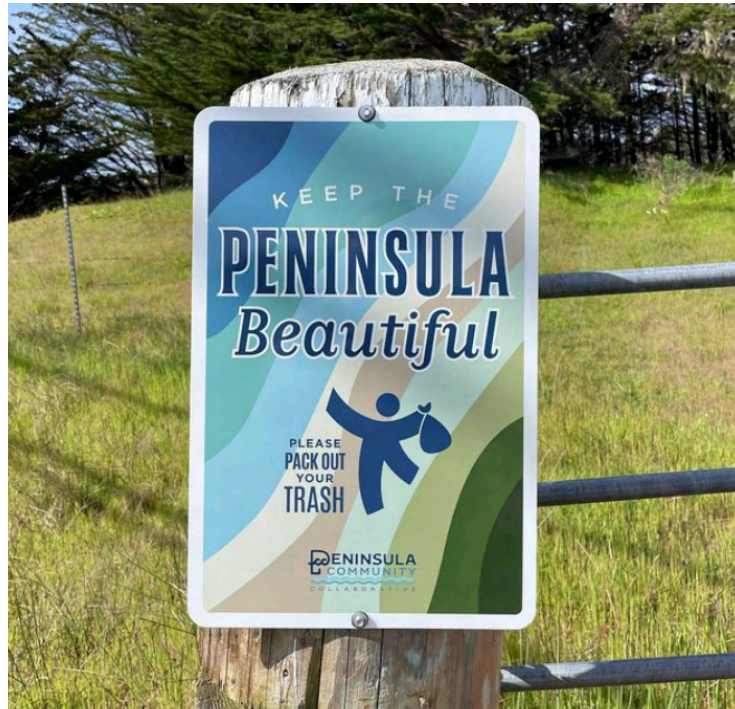
Look out for our campaign signs around the Peninsula!

Remember to follow our keepthepeninsulabeautiful Instagram page to stay connected, hear about our final mural celebration and grant events, and spread the message of our anti-litter campaign to keep the Samoa Peninsula safe and trash-free!