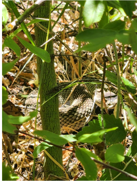
Calf and Rattlesnake in Six Rivers National Forest