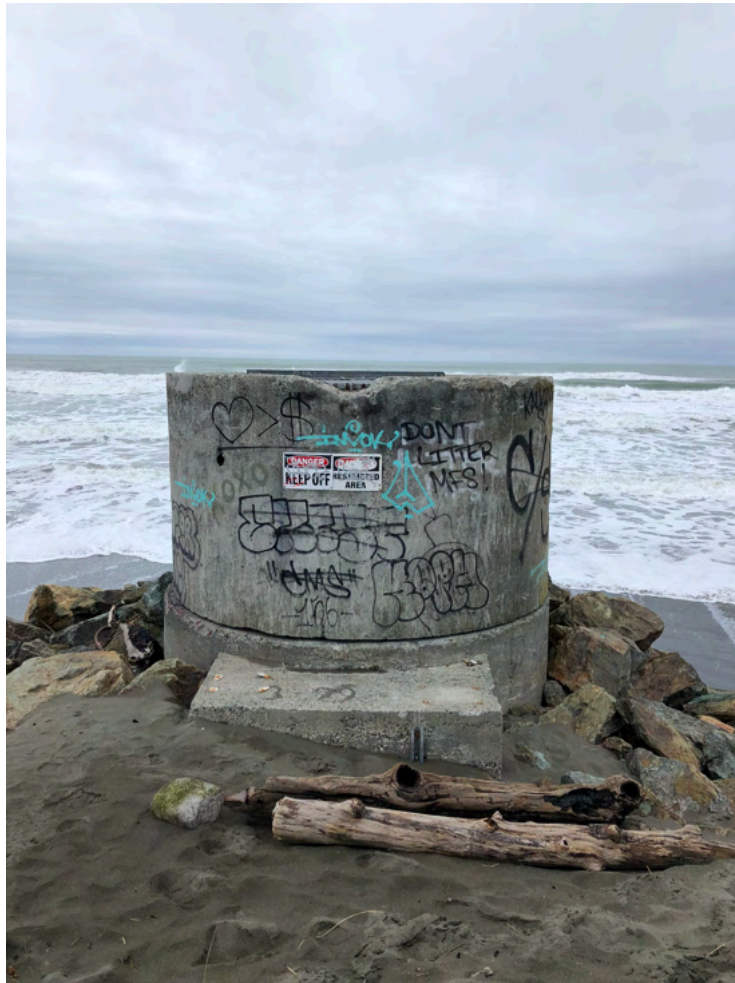
Before mural | HBMWD Overflow pipe New Navy Base Road