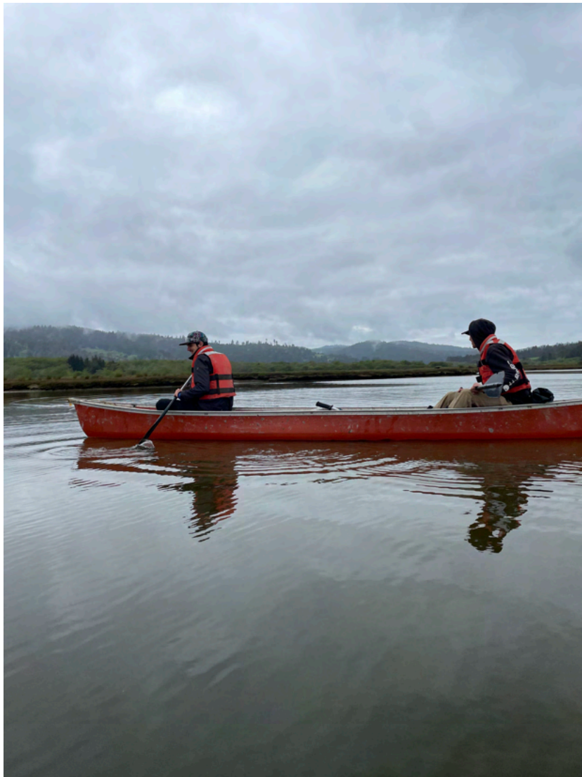
Kayaking to work at White Slough