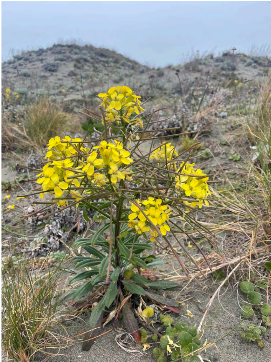
Wallflower at Friends of the Dunes

“Start by doing what’s necessary, then what’s possible; and suddenly you are doing the impossible.”