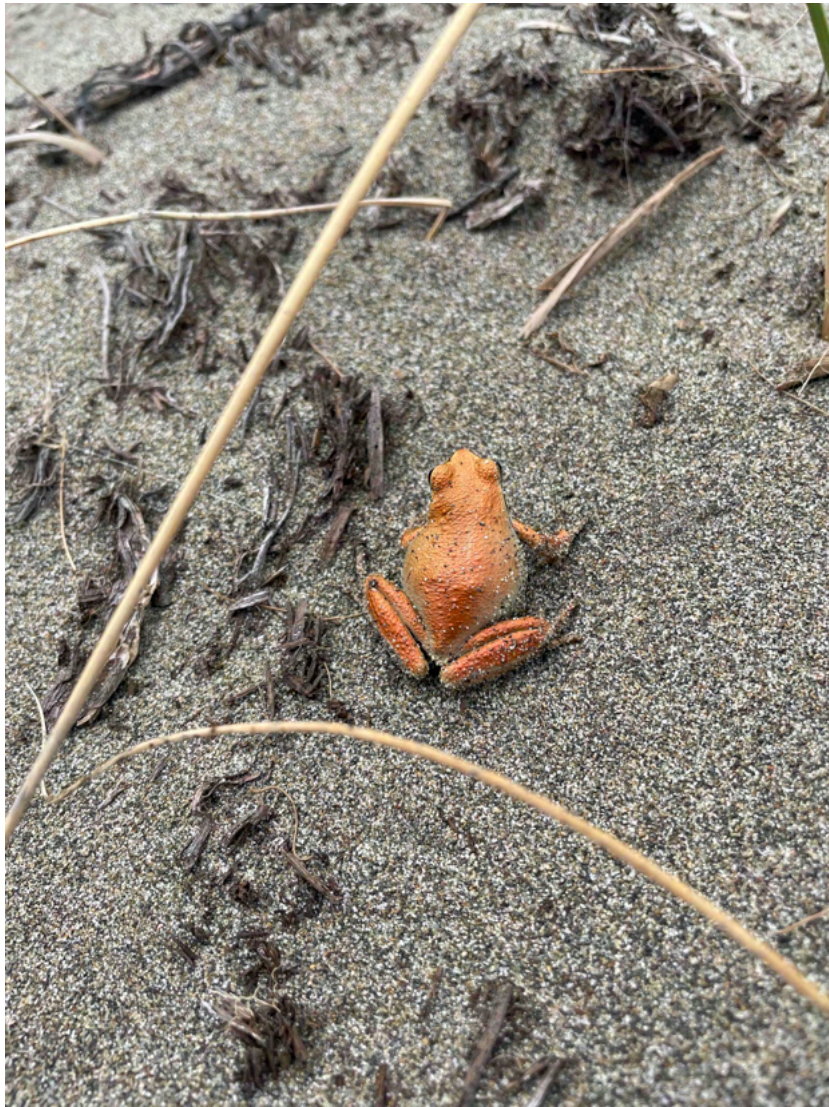
Orange frog at Friends of the Dunes