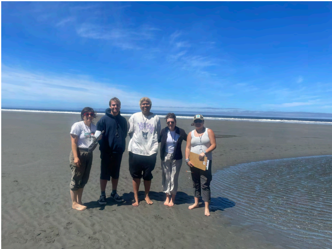
RCAA staff with Cal Poly student interpreters