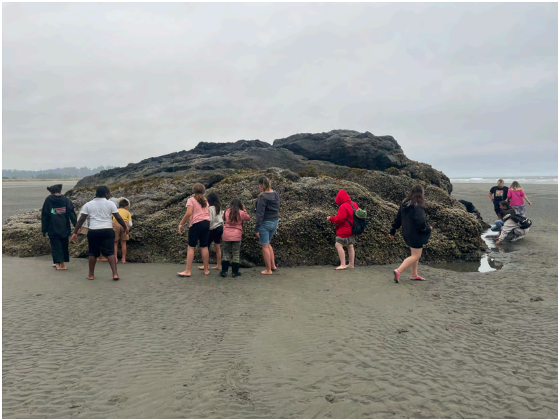
Student exploring Barnacle Rock

Little River Splash! was funded by the CA State Coastal Conservancy's 'Explore the Coast' grant funding. Over the summers of 2023 and 2024, RCAA staff coordinated naturalist-led coastal experiences for youth from supported summer school programs (targeting low-income, under-resourced youth, and their families). RCAA trained Cal Poly's student leaders to help facilitate a series of Moonstone Beach explorations of 'Barnacle Rock,' 'Dragon Cave,' 'Secret Spring,' and the Little River beach environment. In the summer of 2023, an additional kayaking trip in the Little River was offered to youth participants and their families. In the summer of 2024, the youth enjoyed an additional tour of Humboldt Bay salt marshes aboard the Madaket. Approximately 150 elementary school-aged youth were served in addition to many family members.