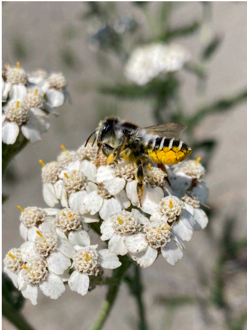
Silver Bee on Yarrow at Friends of the Dunes | Photo by Claire Durbin