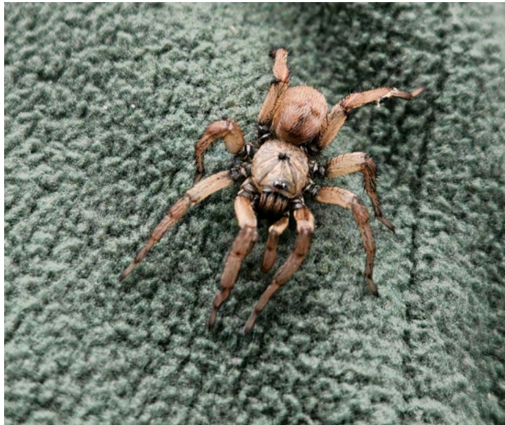
Trapdoor Spider at Friends of the Dunes