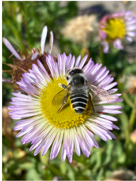
Acmon Blue Butterfly on Beach Buckwheat and Silver Bee on Seaside Daisy at Friends of the Dunes