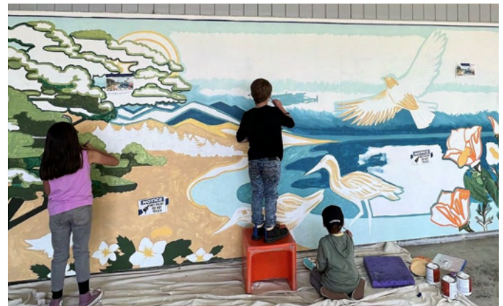
Sophia Levesque and students | Peninsula Union Elementary School in Samoa