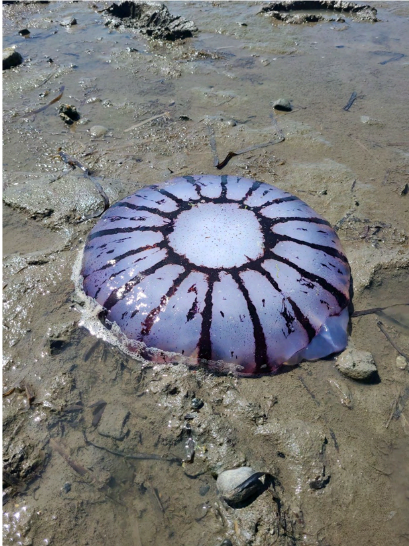
Compass Jellyfish at White Slough

Our crew works diligently on various projects, often in challenging conditions. Their efforts take them to some truly beautiful locations throughout Humboldt County. Along the way, they encounter a range of fascinating sights and experiences. Here are some of their observations from the field.