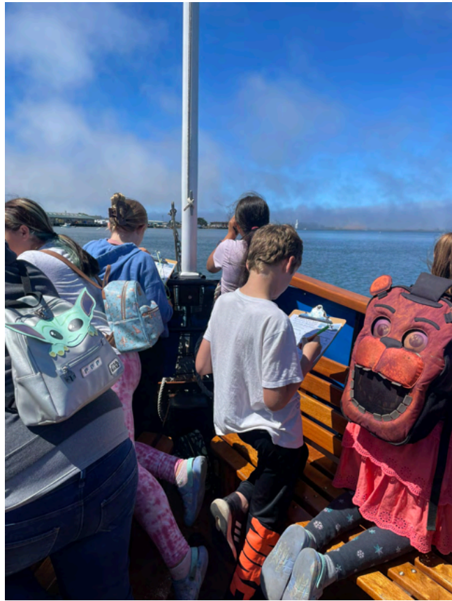
Students aboard the Madaket